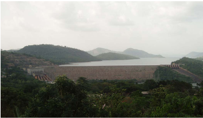
Lake Volta and the Akosombo Dam

Despite the fact that Ghana represents one of the most severely affected countries from chronic schistosomiasis, little effort has been made to address this public health issue through control programs. The latest schistosomiasis intervention strategy was led by World Vision International and carried out between 2009 and 2011. The strategy was based on the World Health Organization's current recommendations emphasizing mass drug administration of praziquantel in school-aged children as part of a package to address endemic parasitic diseases [7]. Small scale studies have suggested that an integrated approach to control that includes health education, sanitation improvement, and reduced human-water contact is necessary for success [8].